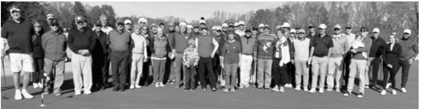
Participants in the Reindeer Open